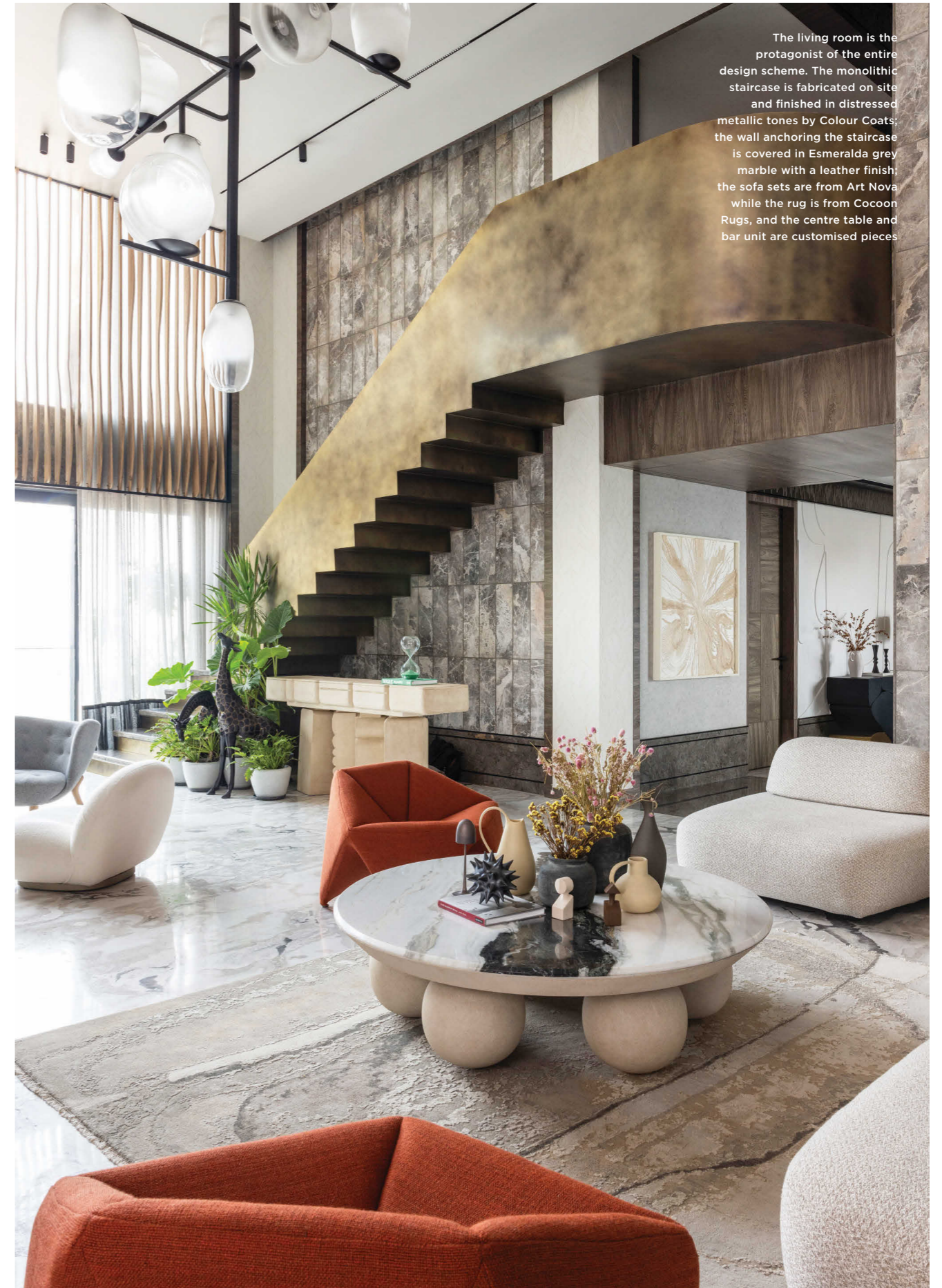
The living room is the protagonist of the entire design scheme. The monolithic staircase is fabricated on site and finished in distressed metallic tones by Colour Coats; the wall anchoring the staircase is covered in Esmeralda grey marble with a leather finish; the sofa sets are from Art Nova while the rug is from Cocoon Rugs, and the centre table and bar unit are customised pieces.