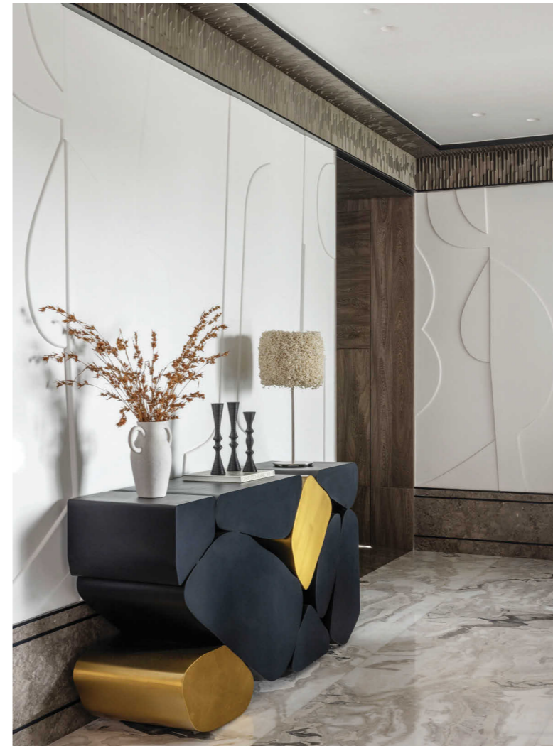
The black console is an avant-garde piece from Giani's En Vogue and steals the spotlight in the dining area. The rustic-looking lampshade is from Lumiere

A PERFECT BACKGROUND SCORE/MUSIC FOR THIS HOME WOULD BE?