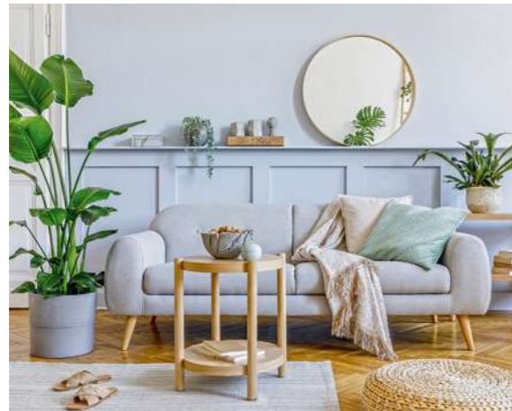
CLOCKWISE FROM TOP LEFT: Per Magnus Persson/ Gettyimages; Dag Sundberg/ Gettyimages; SharfPhotos/ Shutterstock; followtheflow/ Shutterstock

Tushant Bansal of Tushant Bansal Design Studio has a clear vision on ways to give your bath area a new look: "Make niches in the wall rather than installing individual racks. Use framed glass partitions and a runner in the dry area for added warmth. Keep the countertop organised; I prefer under-counter sinks. Avoid patterns as they can make the room look smaller. Install a full-length mirror and wall lights to add design elements to the space." For the kitchen, Bansal advises creating a small pantry (if space permits), dedicating a tilted drawer base to store spices, breaking the monotony of solid block surfaces with some glass cabinets, and using an interesting backsplash after identifying the focal point of the kitchen—this could be a marble pattern or even a glazed hand-made tile.